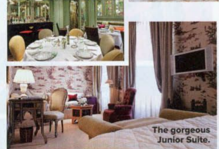
The gorgeous Junior Suite.