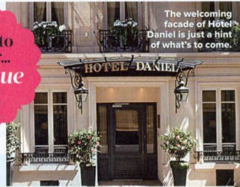
The welcoming facade of Hôtel Daniel is just a hint of what's to come.

RELAX Simply reclining on a comfy chaise in the lounge area reading your copy of A Moveable Feast by Ernest Hemingway will have you rejuvenated. CHECK IN Double rooms start at $507* per night; see hoteldanielparis.com .