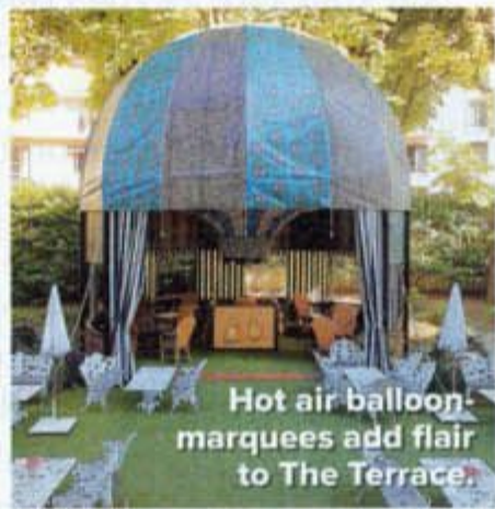
Hot air balloon-marquees add flair to The Terrace.