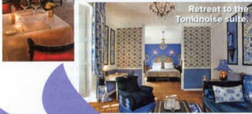
Retreat to the Tonkinoise suite.