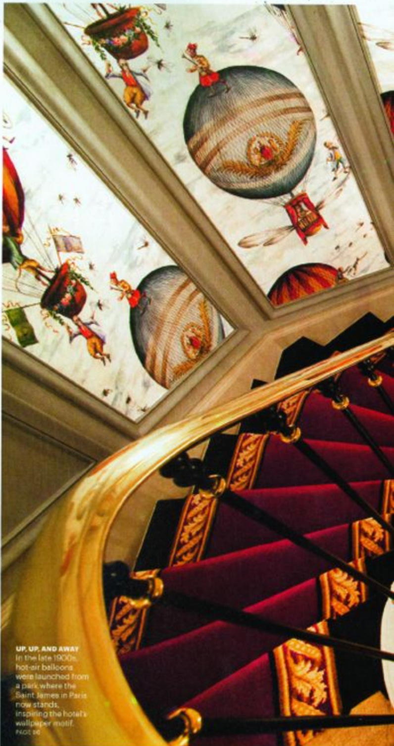
UP, UP, AND AWAY In the late 1900s, hot-air balloons were launched from a park where the Saint James in Paris now stands, inspiring the hotel's wallpaper motif. HOTEL.COM

The space: A super-chic 28-story hotel with 207 rooms, across the street from the Xintiandi shopping and eating hub. The look: Spare and mod, with a few special touches such as the curved, woody hallways decorated with commissioned art illustrating such Chinese sayings as “a crane standing among the chickens”—that is, a person who stands out from the crowd. The experience: Far from the glam-but-boring business hotels in the Pudong business district, the Andaz oozes the stylish new sensibility of China's affluent youth. It also feels homey despite its size, with free snacks at the two islands that serve as friendly check-in desks and free